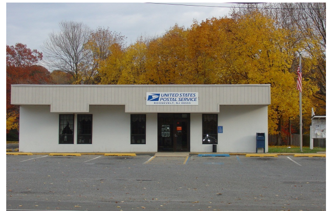
Roosevelt Post Office

Water Restrictions (Summer) Large Trash Pickups ( 2 times a year)