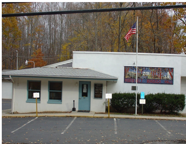
Roosevelt Borough Hall

More information can be found on the web at this address www.web2sons.org