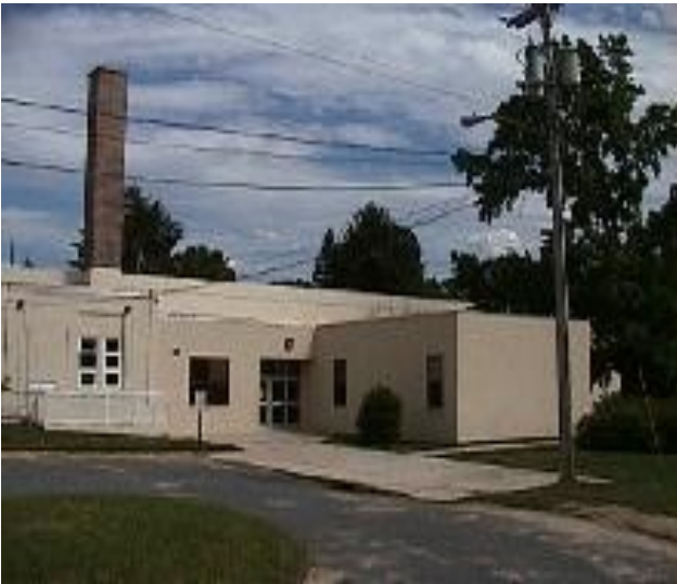
Roosevelt Public School

Roosevelt Public School Mission Statement The mission of the Roosevelt Public School district is to educate and inspire students to excel academically, to become independent and creative thinkers, skillful communicators and lifelong learners. By nurturing and challenging the unique potential of each student, our children will develop individual, social and civic responsibility as well as respect for themselves, each other, and the environment.